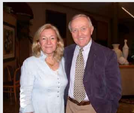
One of many wonderful moments