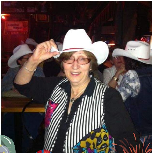
What a party!